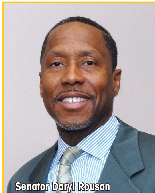
Senator Daryl Rouson

Students - $50 (Includes Student Membership)